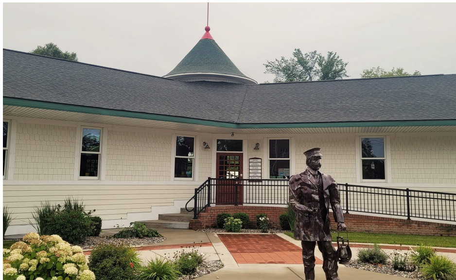
Clare Union Railroad Depot

Do you have a few free Saturdays this summer? Consider spending time greeting visitors at the museum complex of the CCHS.