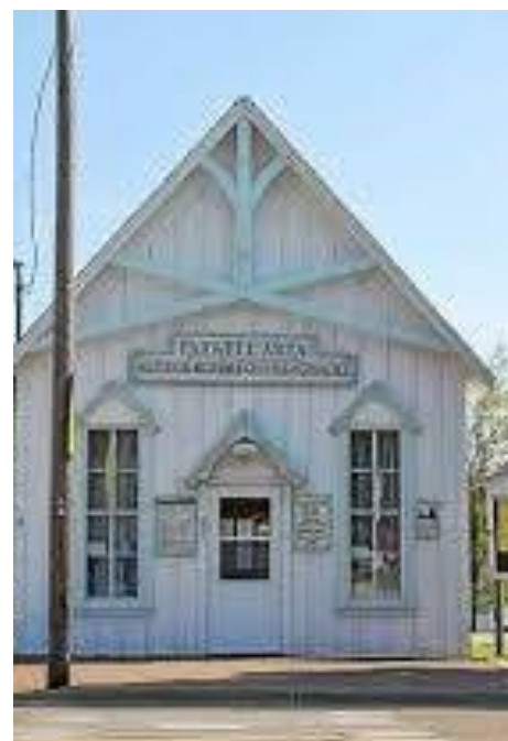
Farwell Area Historical Museum

Farwell Area Historical Museum is located on Main Street in Farwell and they are open from 12-4 on Saturday's through September. Their building dates back to 1882 and is full of interesting things about the Farwell area.