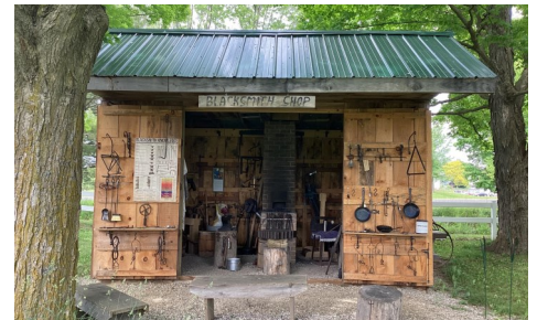
Blacksmith shop at CCHS