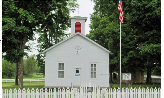
The Dover School

Museum complex opens Saturday, May 2 See you soon!