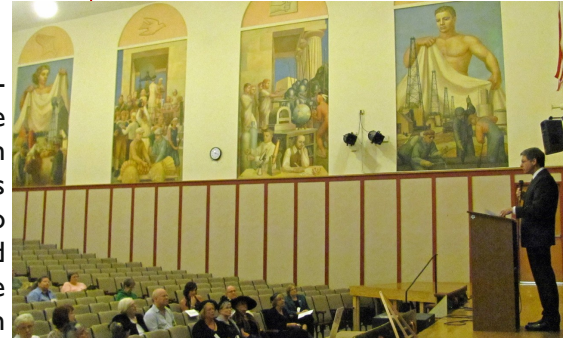
Mast murals at Clare Schools.

accessible location could also make them a major tourist draw. However, district taxpayers should not be put on the "hook" to pay for a national treasure. As much as we at CCHS love art and history, taxpayer tax dollars should be used to