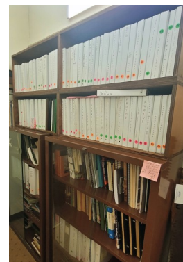
Book shelf at the museum