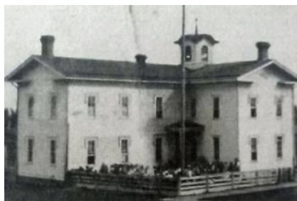
The 2nd Farwell School, built in 1873.