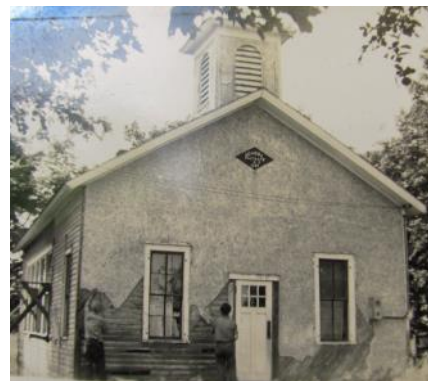
Dover School about 1939 when the stucco exterior was replaced.

It is very likely that Farwell would have most likely still been in the planning stages at that time, since the railroad had not yet come through the county, and Old State Road had not been built (that did not occur